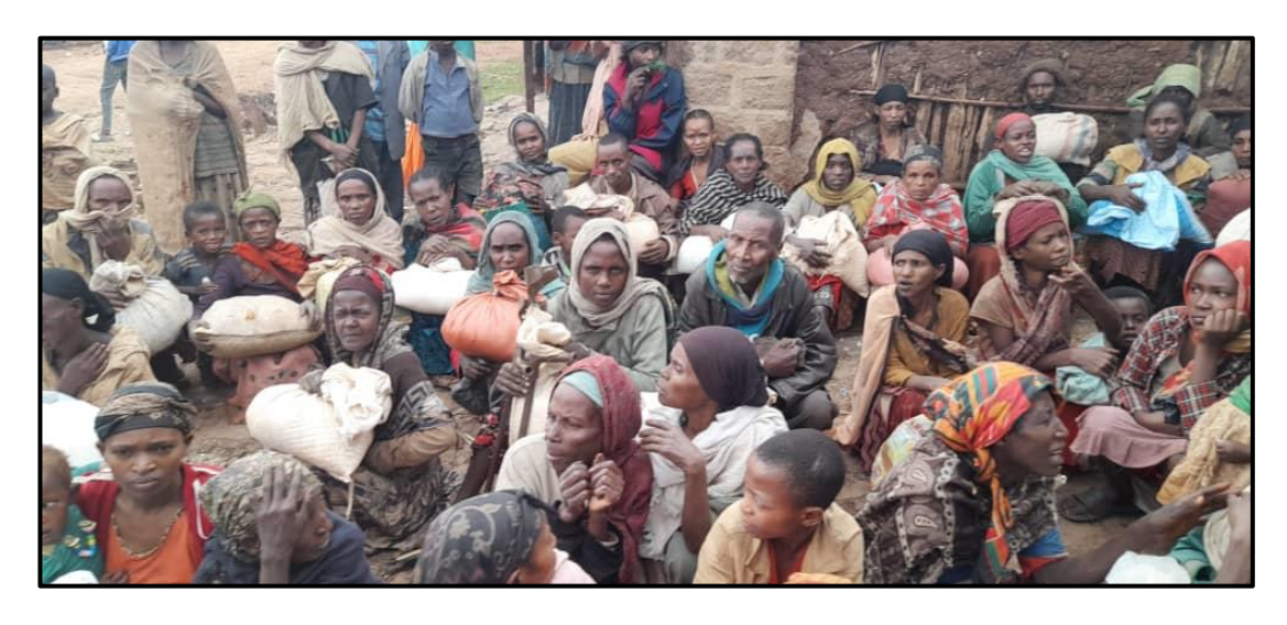
Grain distribution outside the mill

The cost of a basic staple flour in Ethiopia at about 60p per kilo is not far off its cost in the UK or other European countries and is completely beyond the purchasing power of almost all rural subsistence farmers in Ethiopia. In the Sidamo region where we are operating, families typically subsist by growing what they can in their own plots and supplementing this with a few other essentials when some family members can earn money in the coffee picking season.