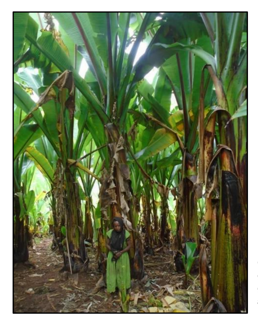
Great to behold these fully grown false banana trees given to a family five years ago!

We have now been distributing false banana seedlings for some years. It has been great to revisit some of the original recipients and see how they are doing. Many families have already benefited from harvests from their trees and have propagated new trees.