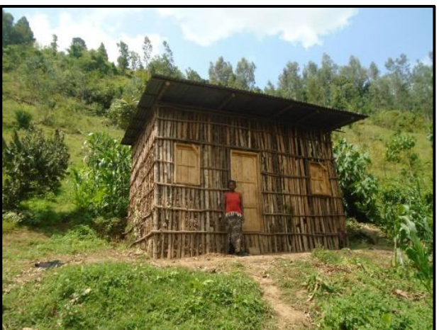
Konjit and her children moved into their new house and no longer have to fear hyena attack at night.